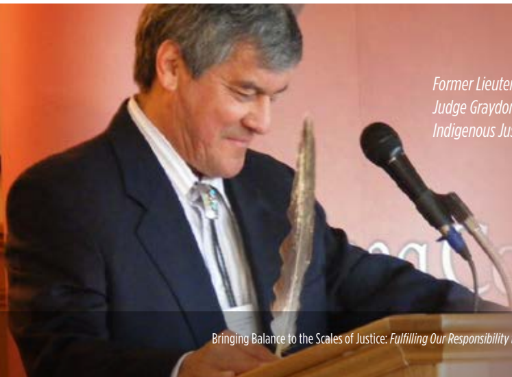
Former Lieutenant Governor of New Brunswick, Judge Graydon Nicholas addresses PEI's annual Indigenous Justice Forum.